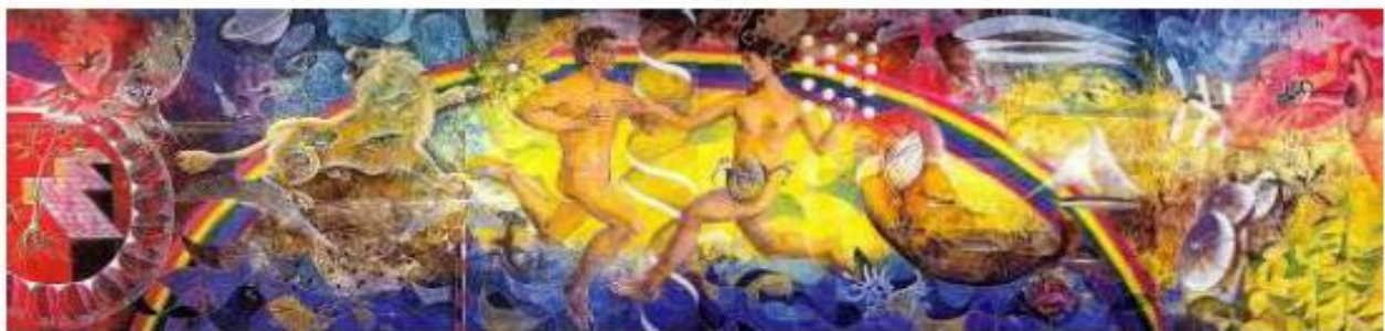
Clean Energy dedicated to humanity by Hans Erni in 2000 A.D.