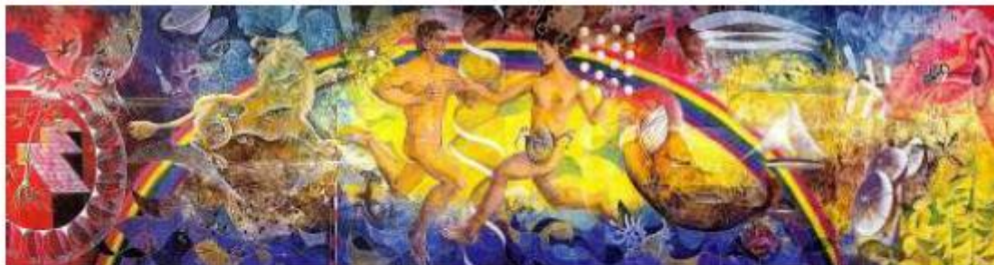
Clean Energy dedicated to humanity by Hans Erni in 2000 A.D.