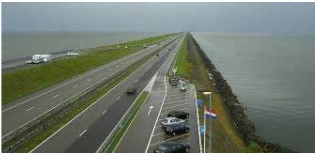
Similar dam protecting Holland from the North Sea

Dams at the straits of Gibraltar and Bab al-Mandab can control the future sea level and provide several GW power as well as rail, road and power cable connections from Europe and Arabia to Africa.