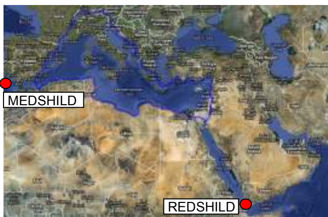
Location of the Dams

The long-term economic and ecological benefits for all 32 bordering nations make these projects viable.